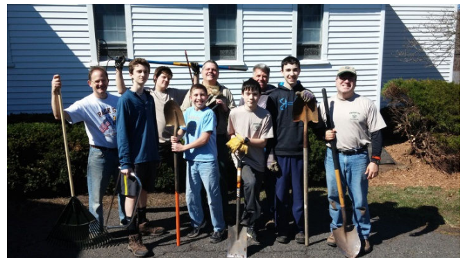
Pictured: Members of Boy Scout Troop #59

Both of these efforts resulted in improving the look of the church grounds and also saved us money.